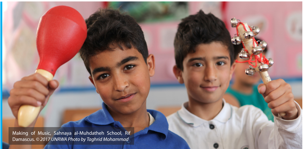
Making of Music, Sahnaya al-Muhdatheh School, Rif Damascus.