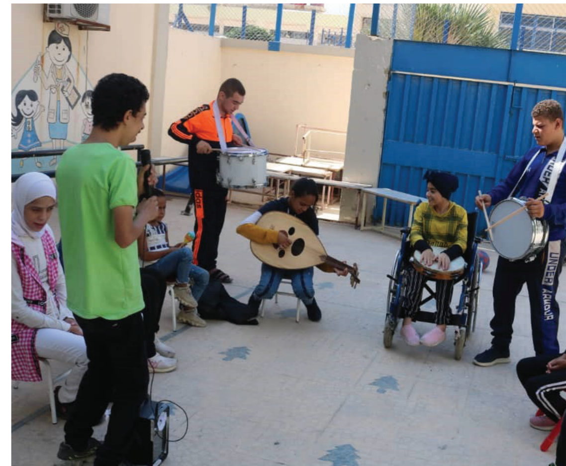
Recreational & sport activities during Summer Club for People with Disabilities in Sbeineh.

ERW awareness flyers were distributed during June. on 31 August, a very severe ERW incident occurred in Ein el-Tal camp resulting seven young boys injured and one of them passed away later. UNRWA is planning to increase the ERW awareness sessions.