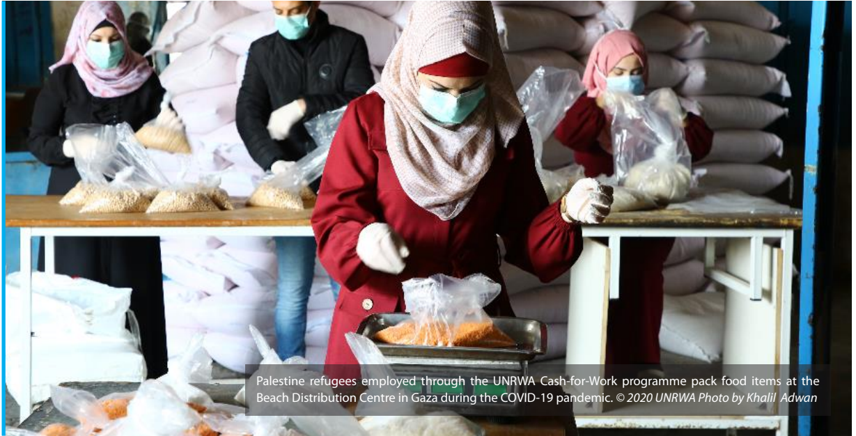
Palestine refugees employed through the UNRWA Cash-for-Work programme pack food items at the Beach Distribution Centre in Gaza during the COVID-19 pandemic.