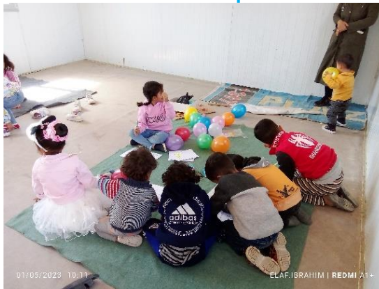
Recreational activities for children in Aleppo, 1 May 2023