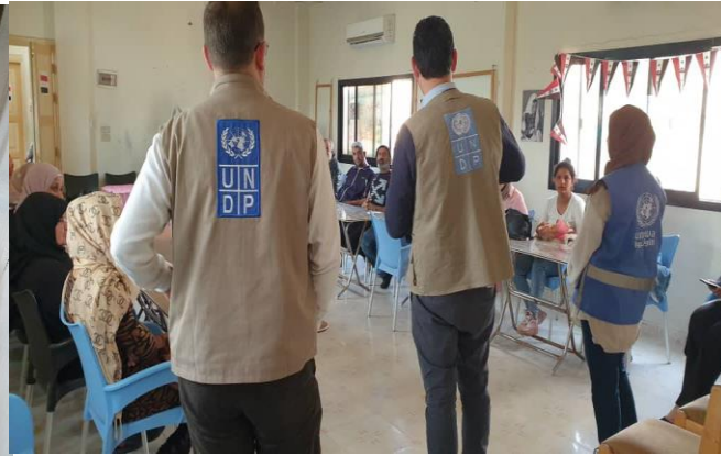
Joint UNRWA-UNDP meeting with earthquake affected families to explain UNDP supported services