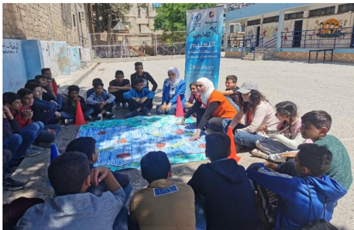
Students PSS activities in Samakh school