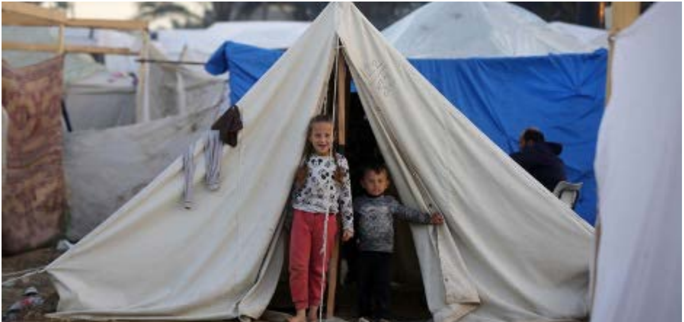
Displaced Palestinian children sheltering in Deir al Balah, middle area of the Gaza Strip, January 2024.